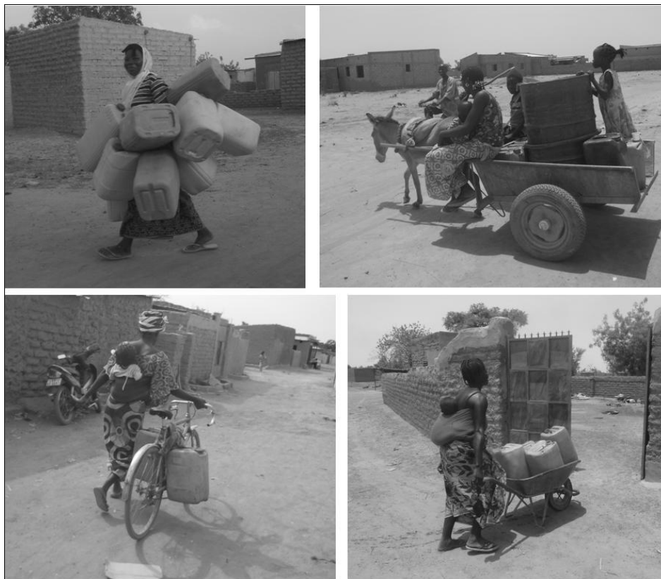
Figure 2. Transportation of water, informal settlements, Ouaga-HDSS, 2012

Multivariate results. The estimated odds ratios from the multivariate analysis are presented in Table 1. Examination of the results revealed that, as expected, factors related to water access had a significant effect on the probability that the primary person responsible of fetching water is a women aged above 16 years old. This is particularly the case for the main source of drinking water, the type of container used for fetching water, the time needed to go to the water source, the waiting time at the water source before having water and the gender of the person in the household that helps occasionally the primary person responsible for fetching water.